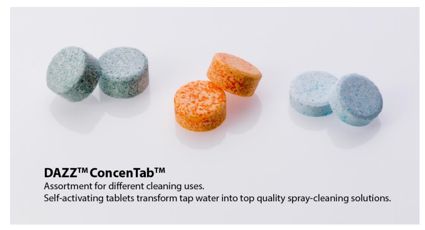
Caption: Super-concentrated refill tabs by DAZZ are the most efficient ever developed for spray cleaners.