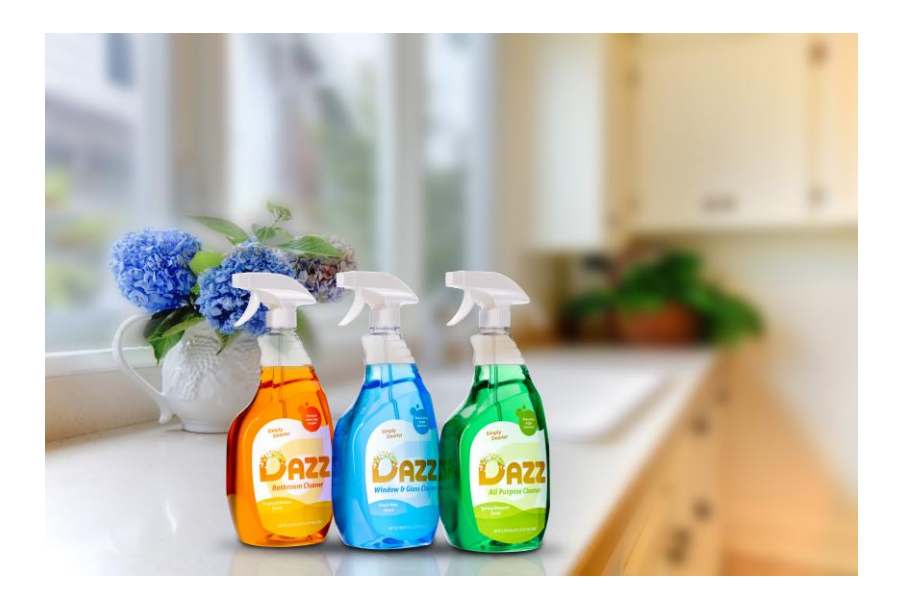
Caption: Self-activated DAZZ spray cleaners shown ready for use.

DAZZ tablets are available in packets that occupy little space for easy storage in a kitchen drawer or almost anywhere. The impact of the DAZZ system can be to eliminate millions of tons of plastic and other packaging waste, reduce carbon creation, electricity use and highway transport issues associated with the manufacturing and distribution of pre-filled spray cleaners that are mostly water. Americans are not the only ones to discard a massive quantity of empty spray cleaner bottles annually; the problem is international with growing global affluence.